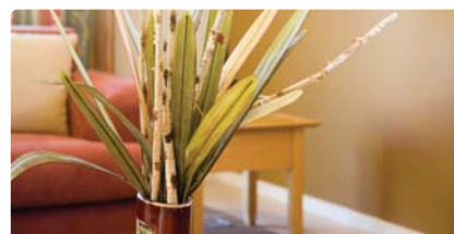
AREAS AND OVERALL SIZE