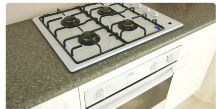
AREAS AND OVERALL SIZE