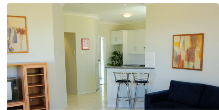
AREAS AND OVERALL SIZE