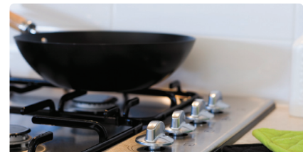
AREAS AND OVERALL SIZE