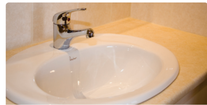
AREAS AND OVERALL SIZE