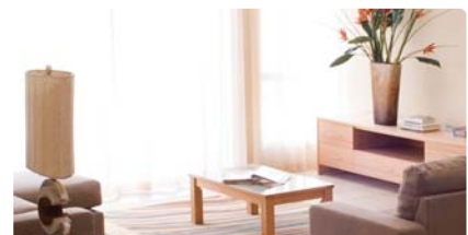
AREAS AND OVERALL SIZE