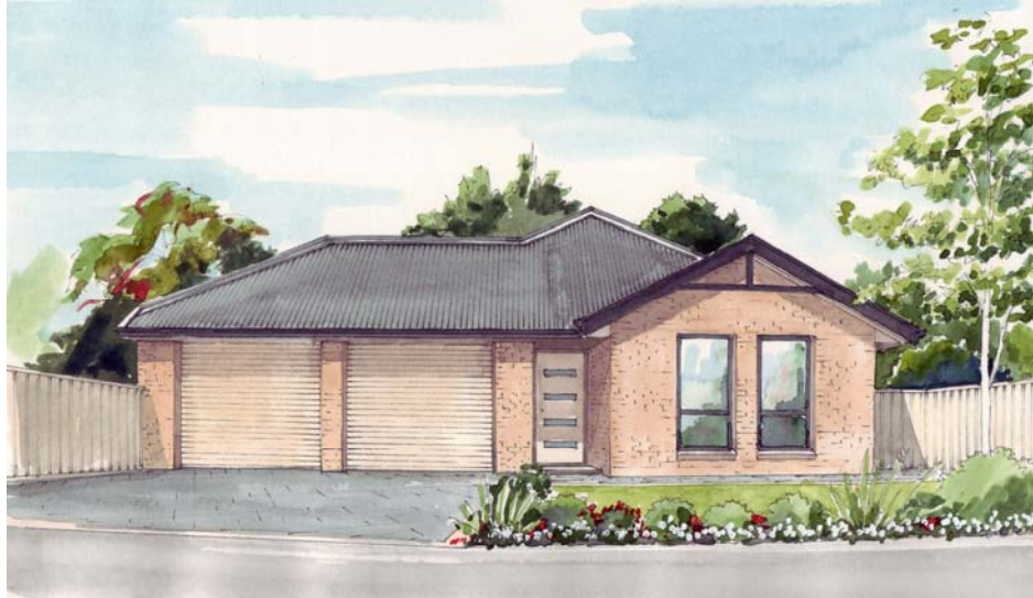
Elevation for illustration purposes only