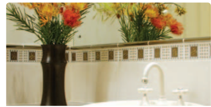
AREAS AND OVERALL SIZE