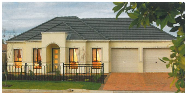
Plans & Photos used as a guide only to product selections E&OE