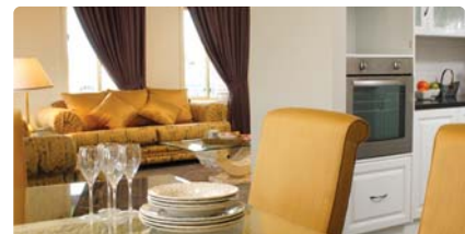
AREAS AND OVERALL SIZE