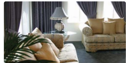
AREAS AND OVERALL SIZE